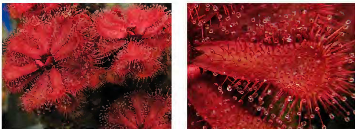
Figure 1: Deep crimson rosettes of Drosera slackii (left) and closeup of lamina (right).

After a few years, D. slackii becomes pedestal forming, with the live rosette sitting on top of a column of previous year’s dead growth, in the same way as the well known D. rotundifolia of Venezuela (Fig. 2). I have a few plants which have remained in the same pot for 6 years and are now approximately 7.5 cm high. To produce this effect it seems important to regularly flush through the compost from above with rain water. I have found that after 3-4 years of being in the same compost, the rosettes of many species start to lack vigour and reduce in size. This I believe is due to a build up of minerals in the upper layer of the compost, brought about by the constant upward imbibement of water. No matter how pure the water used, there will always be an element, however small, of mineral salts which will accumulate in the upper surface, and must be detrimental to growth. For the past 4 years I have regularly flushed the Drosera plants from above, usually every 3-4 weeks in the